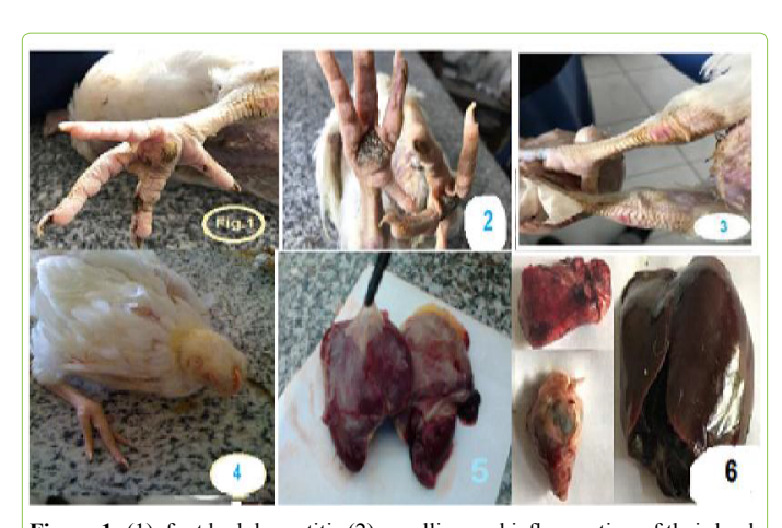
Figure 1: (1), foot bad dermatitis (2), swelling and inflammation of their hock joint (3), inability to stand (4). Post Mortem examination showed that 45 out of 120cases showed congestion of liver with clear perihepatitis, congestion of lung and pericarditis of heart (5 and 6).

In this study, the observed clinical signs in diseased broiler chicks were: swollen foot pad Figure 1: (1), foot bad dermatitis (2), swelling and inflammation of their hock joint (3), inability to stand (4). Post Mortem examination showed that 45 out of 120 cases showed congestion of liver with clear