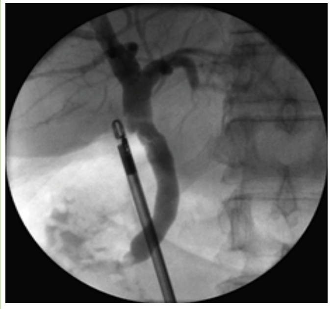
Figure 3: Cholangiogram attained from IOC during SILC.

All of our 18 patients successfully underwent IOC during SILC (100% success rate). All IOC were completed via a single umbilical incision, and no additional ports or percutaneous needle placement were required. No patients reported any intraoperative complications. Of the 18 patients who underwent IOC during SILC, 15 patients' IOC (83.3%) were