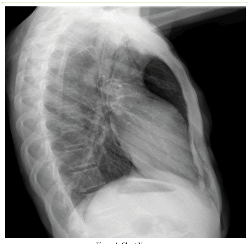
Figure 1: Chest X-ray.

Chest x-ray showed hypo transparency of the Paracardiac mediastinum with a discrete air lamina involving the cardiac silhouette. Computed tomography scan revealed a pneumomediastinum affecting all compartments and extending to the cervical region with coexisting