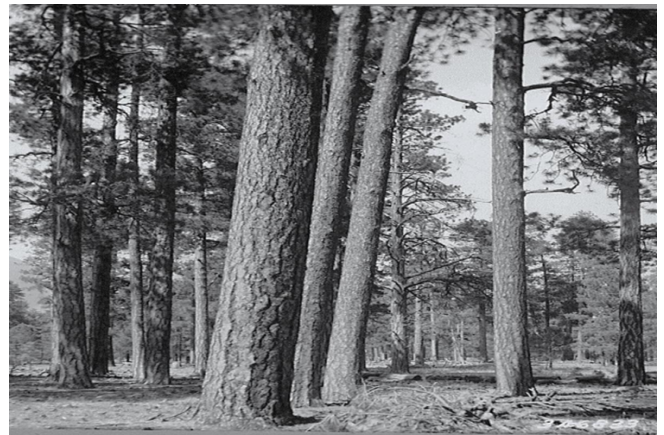
Figure 1A: An unharvested ponderosa pine stand at the turn of the 20th century near Flagstaff, Arizona.

Forest managers, community and environmental leaders recognized that the decline of forest health in the ponderosa