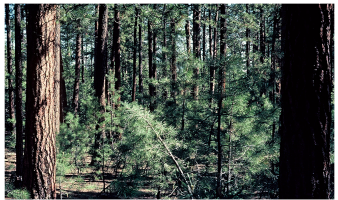
Figure 1B: Conditions in an overstocked ponderosa pine stand on Castle Creek in the Apache-Sitgreaves National Forest.

pine forests and determined that associated environmental degradation must be corrected. There was concern that past fire exclusion had increased the likelihood of high severity wildfires that would impact the City of Flagstaff and adjacent communities. An increased potential for insect and disease outbreaks was another concern. They initiated an effort to improve forest health by working together.