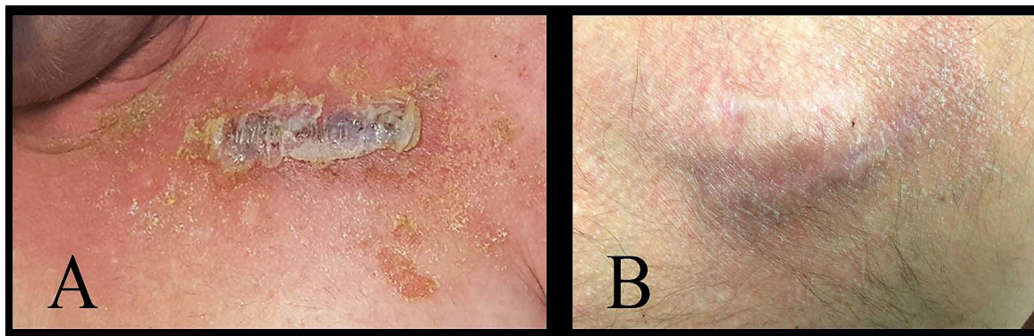
Figure 2: A) Contact dermatitis with extensive skin desquamation and crusting with some vesicular changes. B) Resolution of contact dermatitis with residual minimal desquamation.