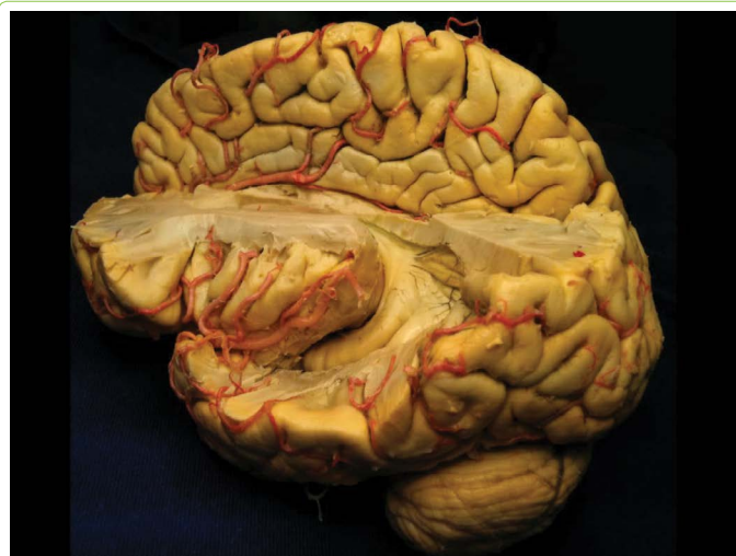
Figure 1: Anatomical location of the hippocampal structure in the human brain (arrow)

[10], the hippocampus participates actively in human actions and behavior. It has already been described that hippocampal alterations can be caused by stress, since it is a structure that has prolonged ontogeny, persistent postnatal neurogenesis and high levels of glucocorticoid receptors [11-13]. In addition, depression is also associated with small hippocampal volume in several studies [14-16]. According to Barnes et al the "late depression" doubles the risk of Alzheimer's disease [17], evidencing that brain structures have too many complex and profound connections which need to be better elucidated.