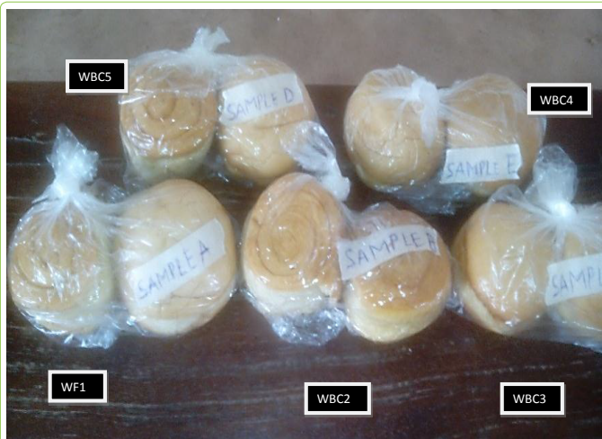
Figure 3: The pictures of the wheat, yellow root cassava, and bambara groundnut-based bread are shown in Plate 1.

Plate 1: Bread samples produced from the blends of wheat, yellow root cassava, and bambara groundnut flours.