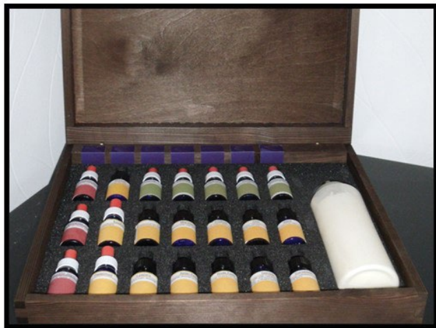
Figure 1: The O-box.